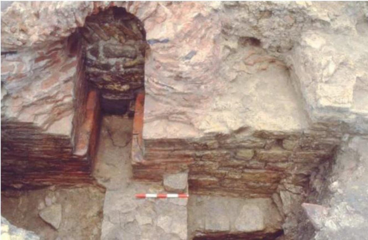
Figure 2. Blocked arches in large late Roman structure, Queen's Hotel

This building continued to be used well into the 4th century AD, with a structural alterations including the infilling of the openings taking place c.AD360. At some point after this, the structure was demolished and there was a further levelling phase. A sequence of four burials was inserted into this infill; these all produced Anglian C14 dates (see below). Nearby were a set of regularly spaced post-holes seemingly comprising a 10m long timber structure aligned on the Roman street. A number of pits also cut from the same level containing Anglian sherds (Tweddle et al 1999, 193, 267). The chronology for the sequence running from the demolition of the Roman structure to the insertion of the pits and burials into the levelling layer remained unclear to the excavators; in the archive report phasing diagram this sequence (Phases 7.6-10) were ascribed a broad late 4th-9th century AD date.