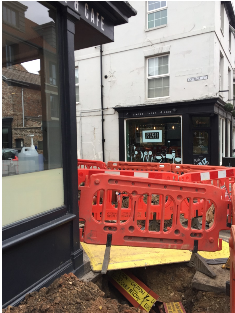
Plate 2 Excavated trench, looking west