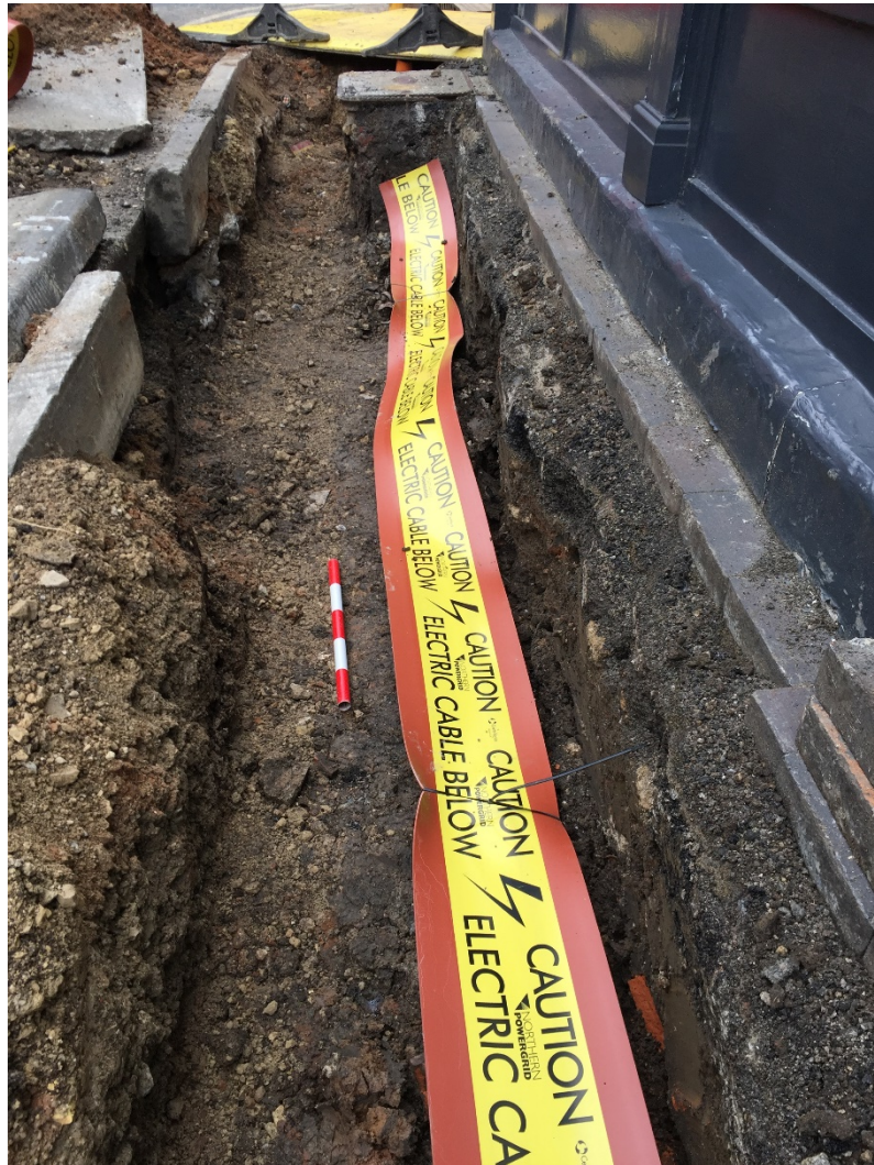
Plate 3 Excavated trench, looking north, 0.1m scale units

This Report has been prepared solely for the person/party which commissioned it and for the specifically titled project or named part thereof referred to in the Report. The Report should not be relied upon or used for any other project by the commissioning person/party without first obtaining independent verification as to its suitability for such other project, and obtaining the prior written approval of York Archaeological Trust for Excavation & Research Limited ("YAT"). YAT accepts no responsibility or liability for the consequences of this Report being relied upon or used for any purpose other than the purpose for which it was specifically commissioned. Nobody is entitled to rely upon this Report other than the person/party which commissioned it. YAT accepts no responsibility or liability for any use of or reliance upon this Report by anybody other than the commissioning person/party.