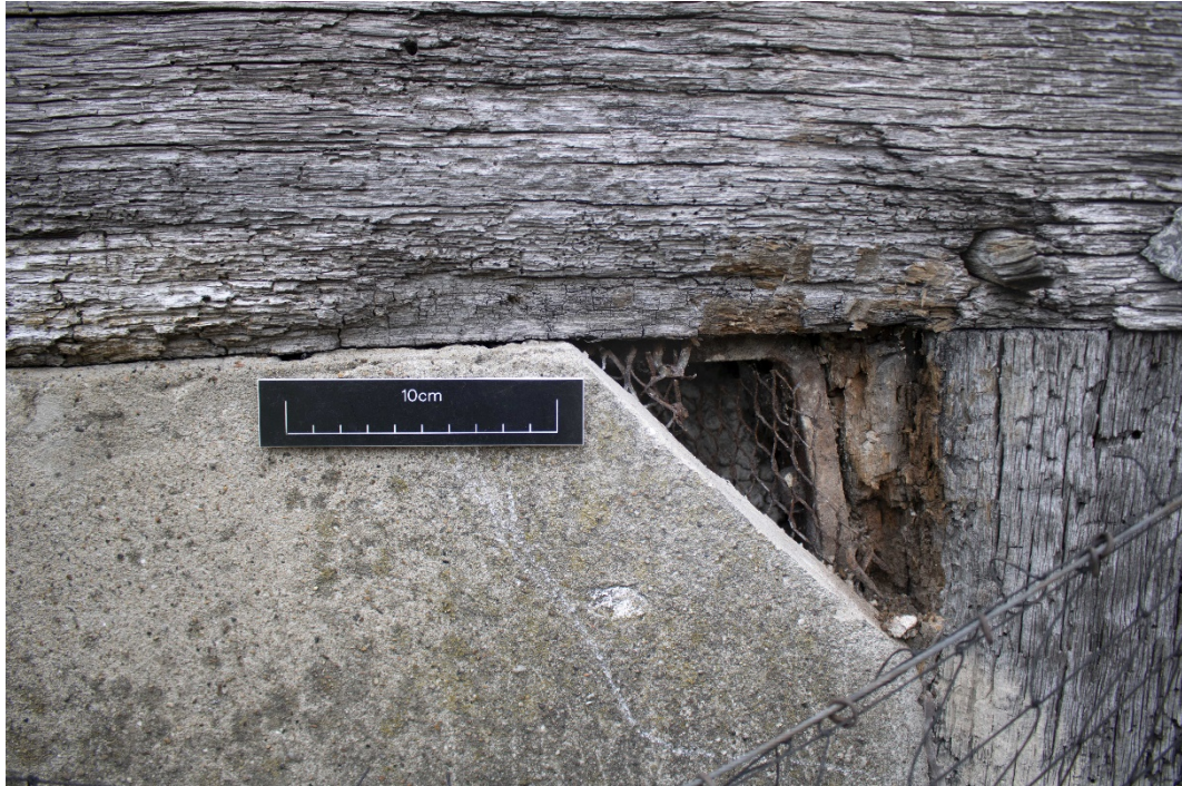
Plate 3 View of inspection cut-away in mid-20 th century render infill panel, facing north, 0.1m scale