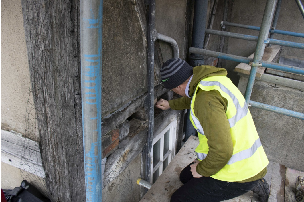
Plate 1 Inspection of timber frame, facing north