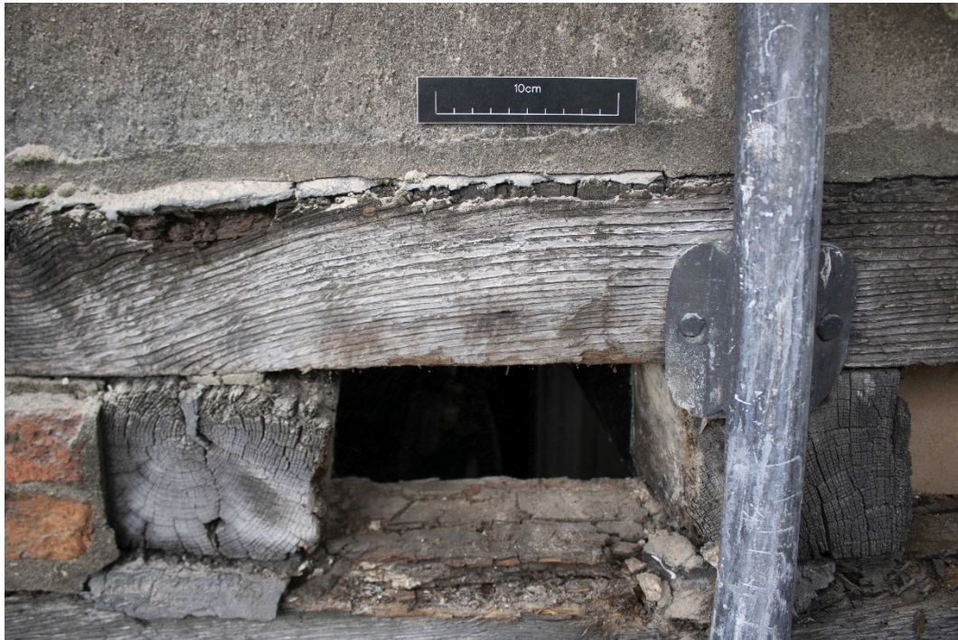
Plate 4 Void behind re-set brickwork between joists at 2 nd floor level, facing north-west, 0.1m scale

This Report has been prepared solely for the person/party which commissioned it and for the specifically titled project or named part thereof referred to in the Report. The Report should not be relied upon or used for any other project by the commissioning person/party without first obtaining independent verification as to its suitability for such other project, and obtaining the prior written approval of York Archaeological Trust for Excavation & Research Limited ("YAT"). YAT accepts no responsibility or liability for the consequences of this Report being relied upon or used for any purpose other than the purpose for which it was specifically commissioned. Nobody is entitled to rely upon this Report other than the person/party which commissioned it. YAT accepts no responsibility or liability for any use of or reliance upon this Report by anybody other than the commissioning person/party.