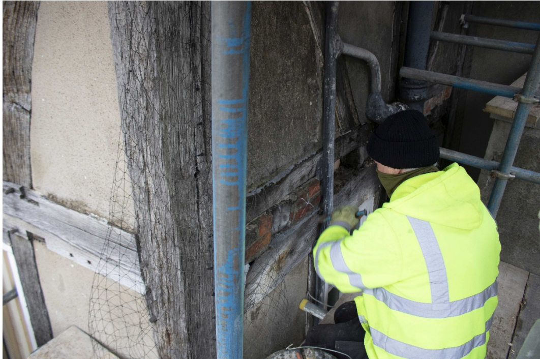
Plate 2 Removal of re-set brickwork between 2 nd floor joists and upper and lower rails, facing north