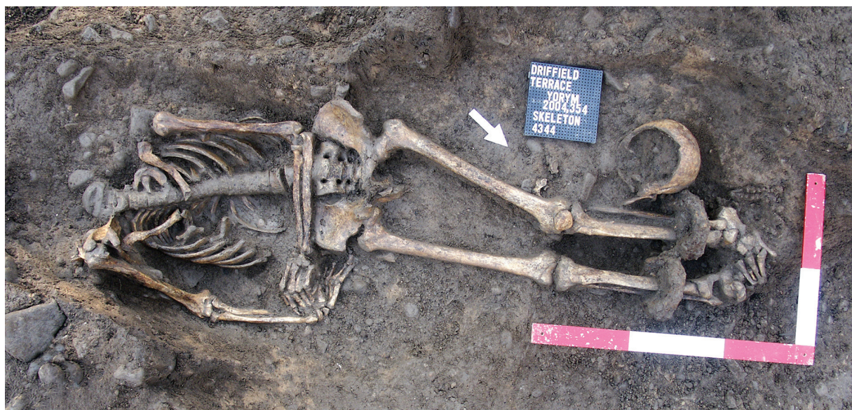
FIG. 6. 3 Driffield Terrace (2004): decapitated Roman skeleton with iron rings around the ankles.

On the opposite side of the main Roman approach road from the south-west, burials have been found at Mill Mount (FIG. 2, 48; OSA 2002a; Spall and Toop 2005b) and a little to the north-