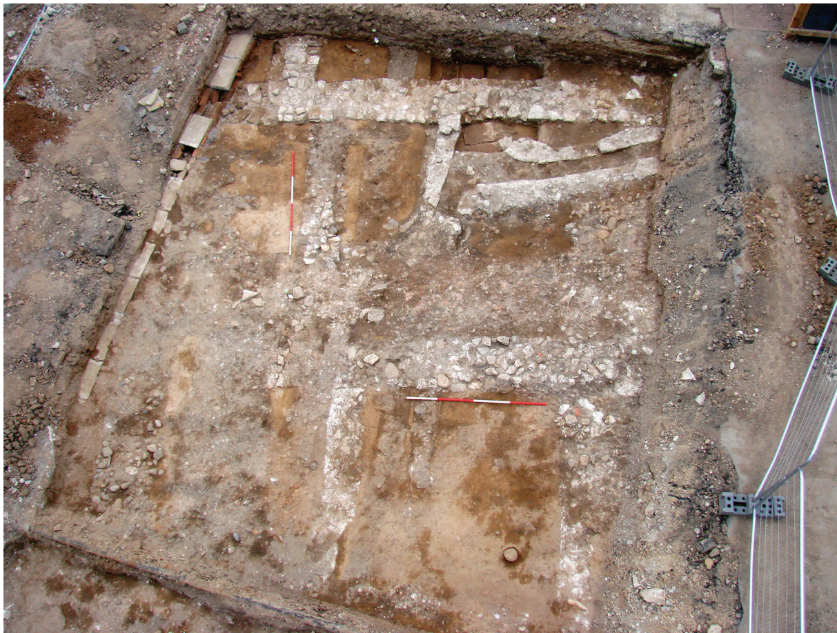
FIG. 4. West Offices (2011): multiphase Roman wall foundations, robber trenches and drains surviving in an area previously truncated for York's first railway station in the 1830s; south-west at top of picture.