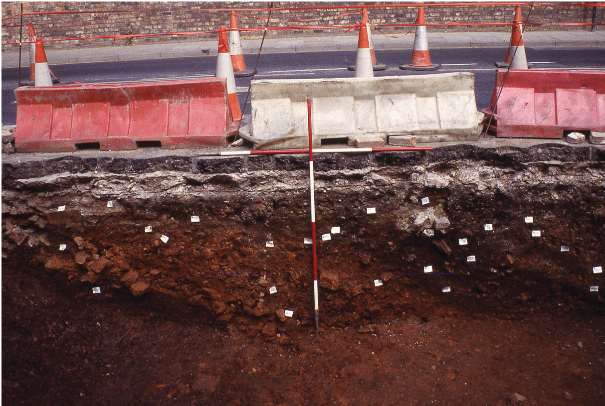
FIG. 5. Peasholme Green (1995): successive dumps of Roman pottery kiln debris. View to the north-west; note that Roman archaeology here is unusually close to modern level.

most part, small-scale evaluations. A report on work by YAT, largely in 1990–2005, and also referring to work by other contractors, has recently appeared in the Archaeology of York series (Ottaway 2011). This adds to and refines knowledge of approach roads, settlement, cemeteries (see below), and other activities.