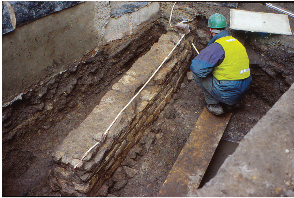
FIG. 3. Davygate (1998): Roman fortress barrack wall in a lift shaft trench.

2, 13; Ottaway 1997). In 2012 small-scale work by YAT in advance of upgrading the display facilities in the ‘undercroft’ below the Minster revealed a street north-east of the principia (the via quintana , FIG. 2, 8).