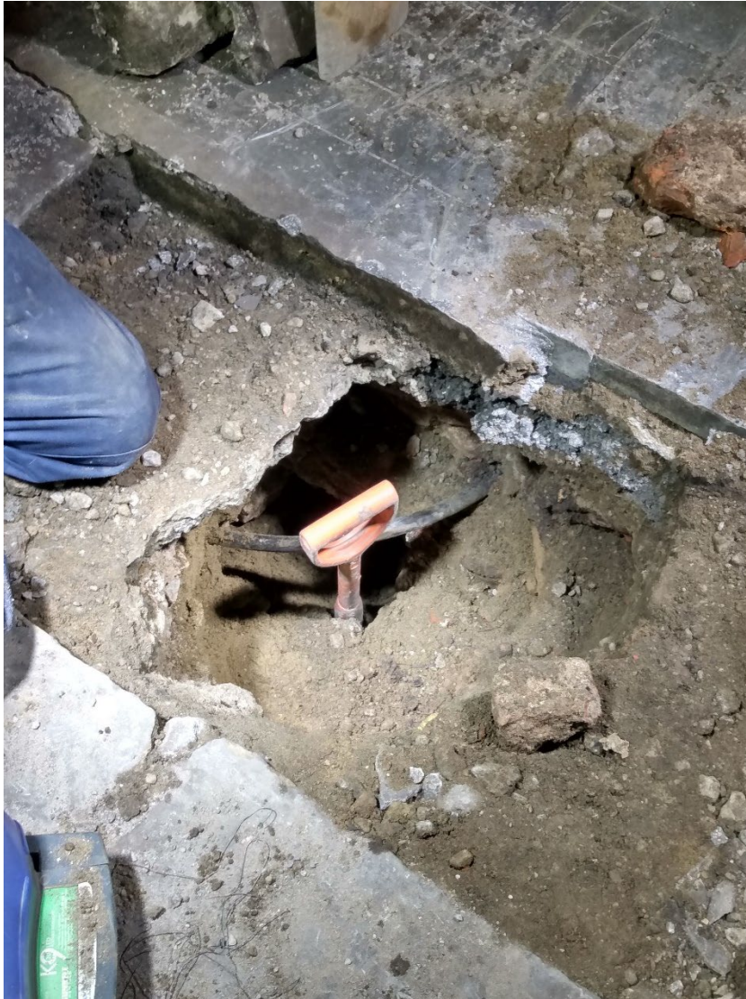
Plate 4: Watching brief area and east facing section, looking southwest.