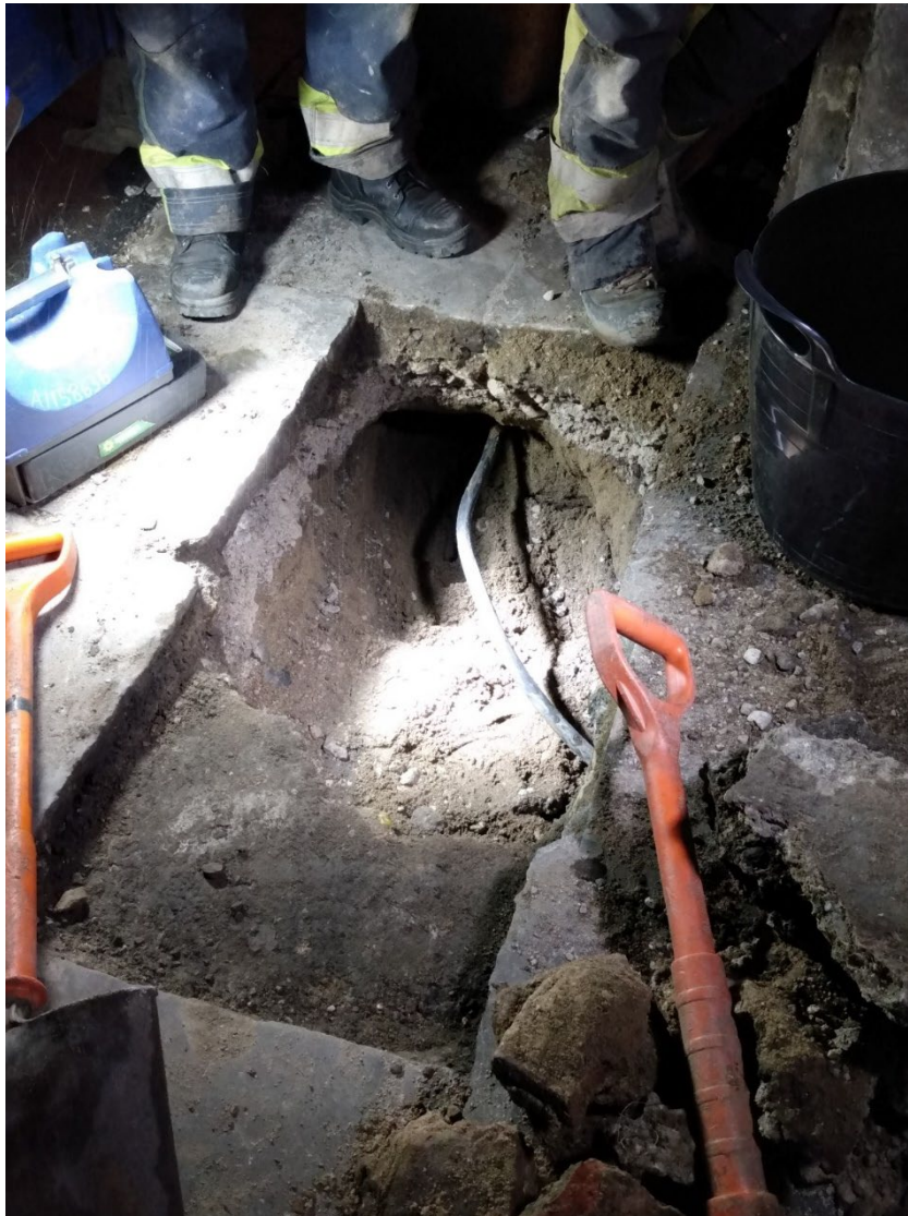
Plate 1: Deposit (1004) and modern service, mid-ex, looking southeast.