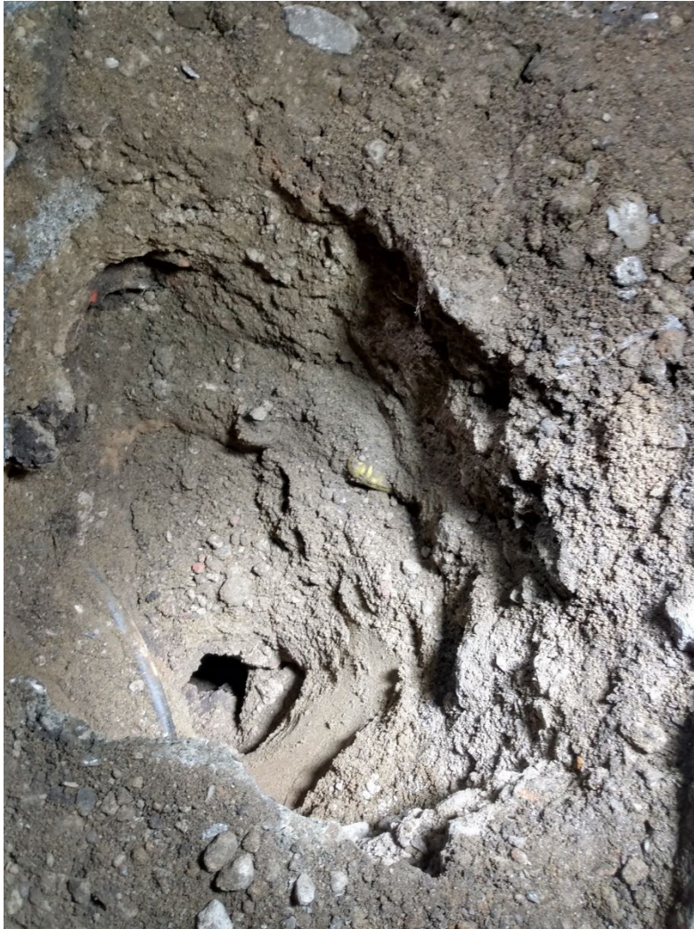
Plate 2: Void encountered at 0.65m below ground level.