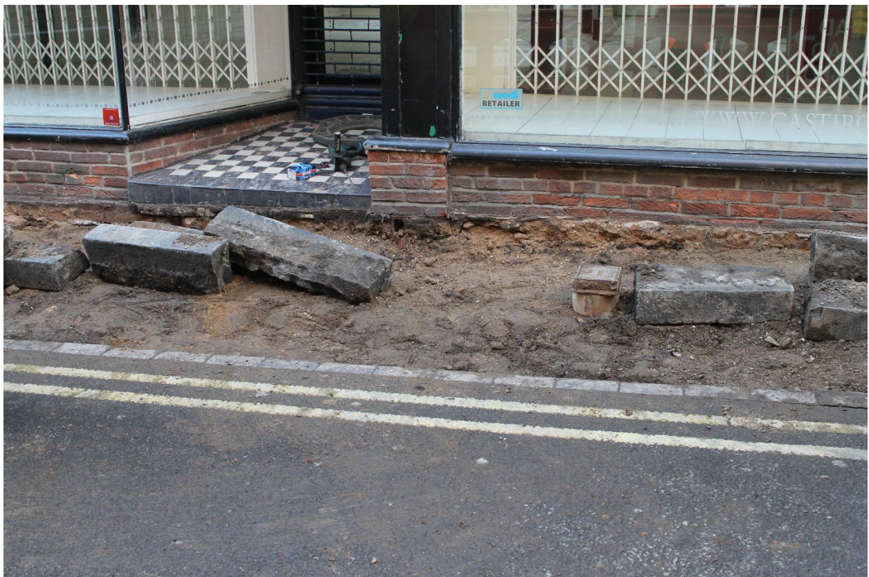
Plate 1: Colliergate, facing west.