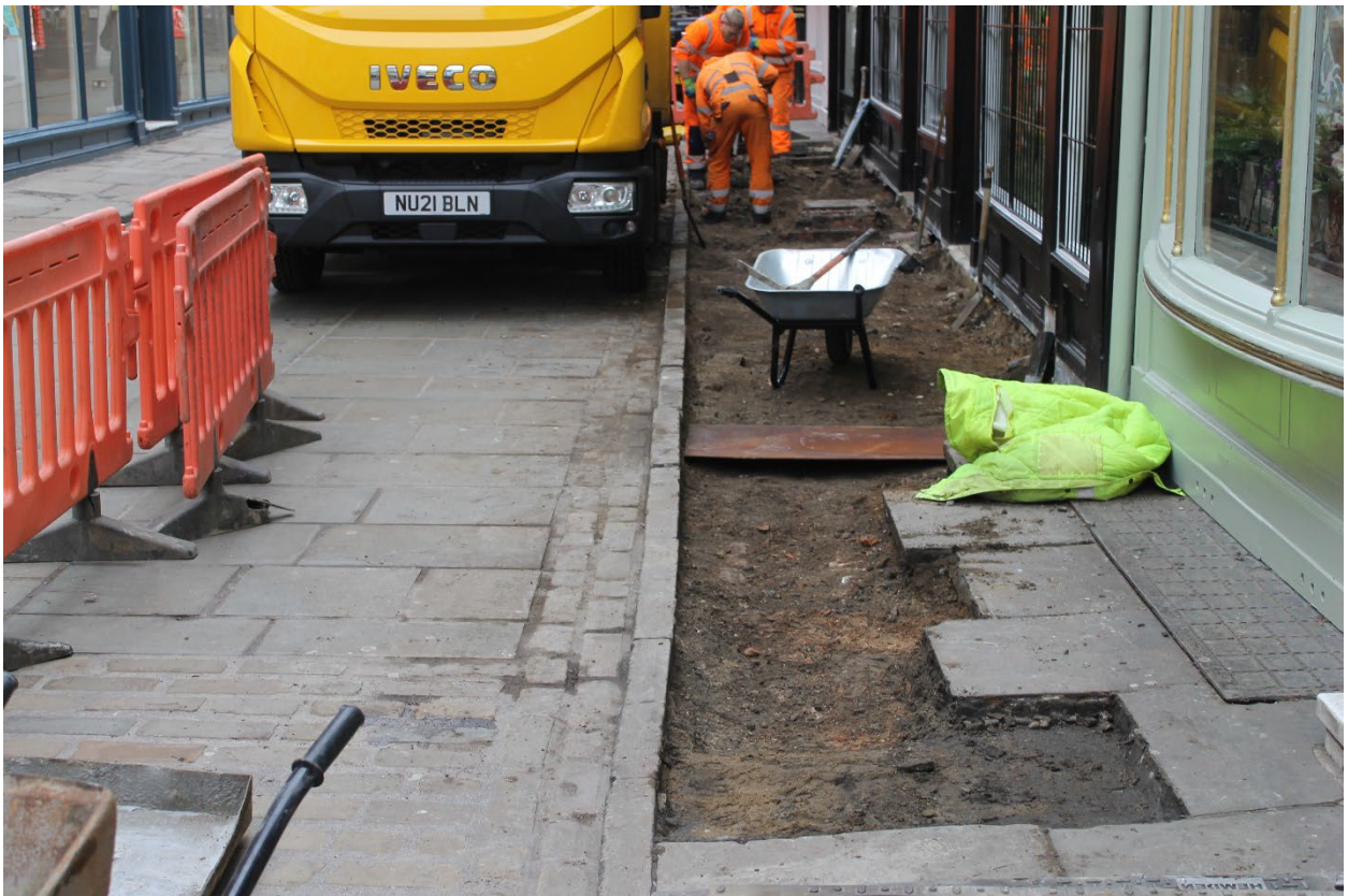
Plate 3: Excavated area at Stonegate, view north-east.