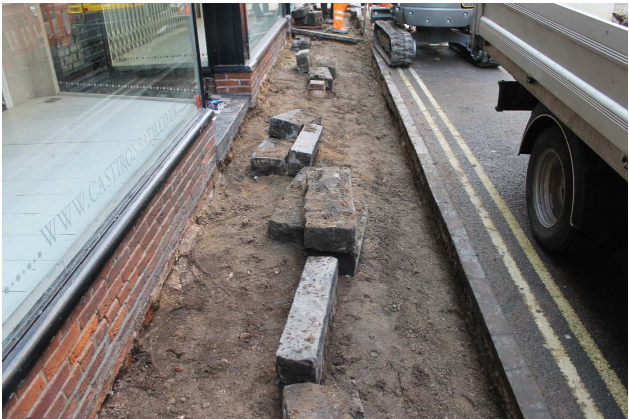
Plate 2: Colliergate, facing north.