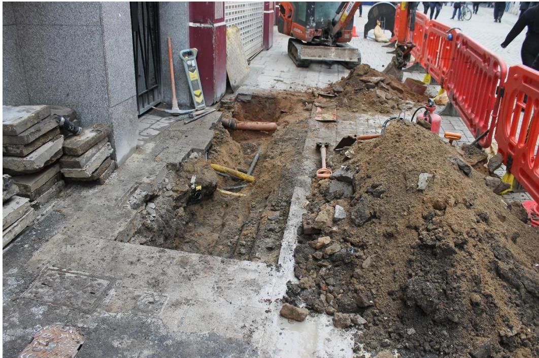
Plate 1 NW direction of trial trench excavation area showing services and pipe