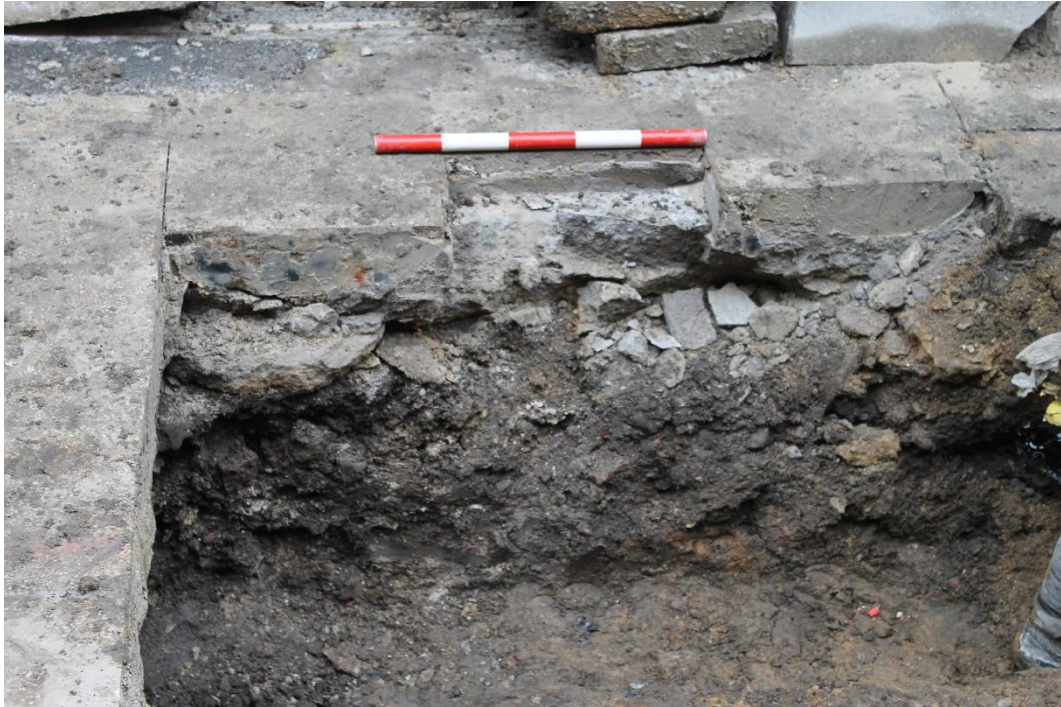
Plate 2: East facing section depicting stratification layers pavement slabs (1001), concrete footing (1002) and made ground (1003)