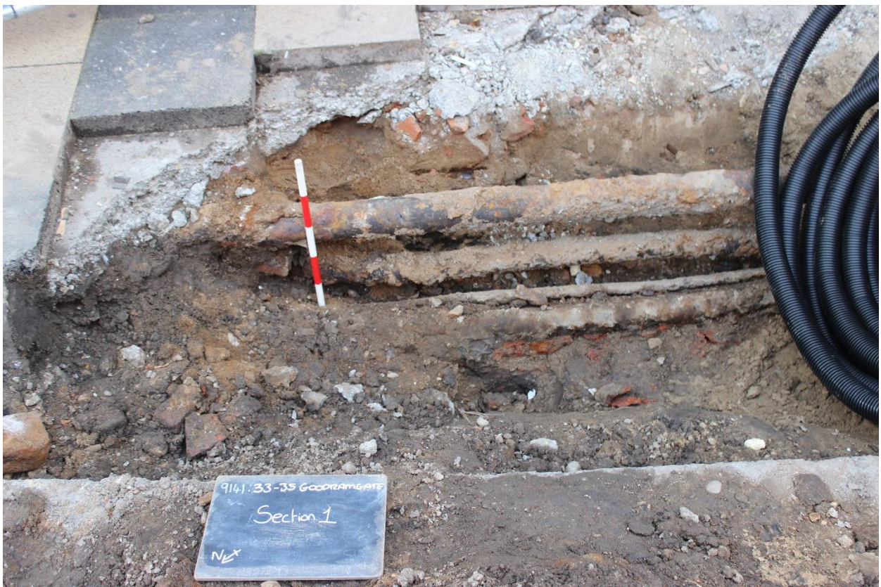
Plate 2 After the removal of gravel, view south-east