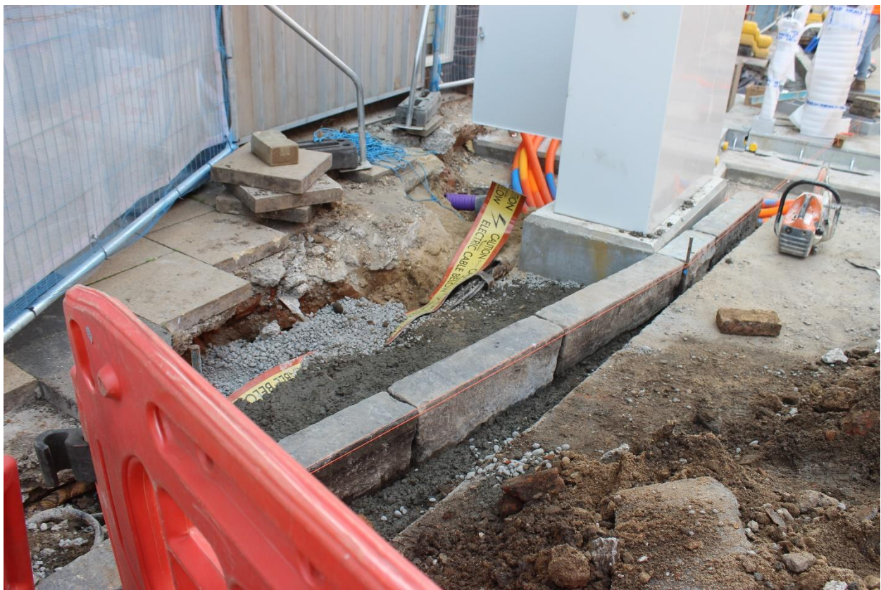
Plate 1 Area pre-excavation, view south-west